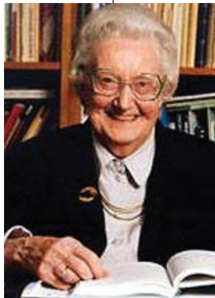
Dame Cicely Saunders 1918 - 2005

For 34 years, she was the Medical Director, Chairman of the Board and Founder/President of St. Christopher's Hospice. She is widely recognized as the founder of modern